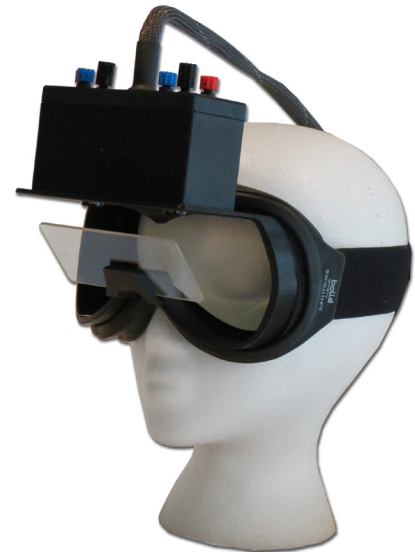
VideoStar Binocular (D1 140932)